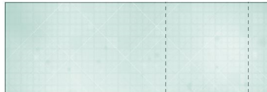
Style #2 - Pattern

Style #2 – Pattern: 2” x 5.5” with 2 stubs, perforations at .5” from right leading edge and 3.3125 from left edge of ticket. Colours available are blue, green, red, purple, white and yellow.