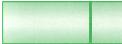
Style #1 - Border

Style #1 – Flood: 2” x 5.5” with 1 stub, perforations at 1.5” from right leading edge. Colours available are blue, purple, green, yellow, red and orange.