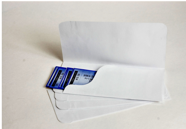
Ticket Jackets, 3.125 x 6.375, 24lb. white wove